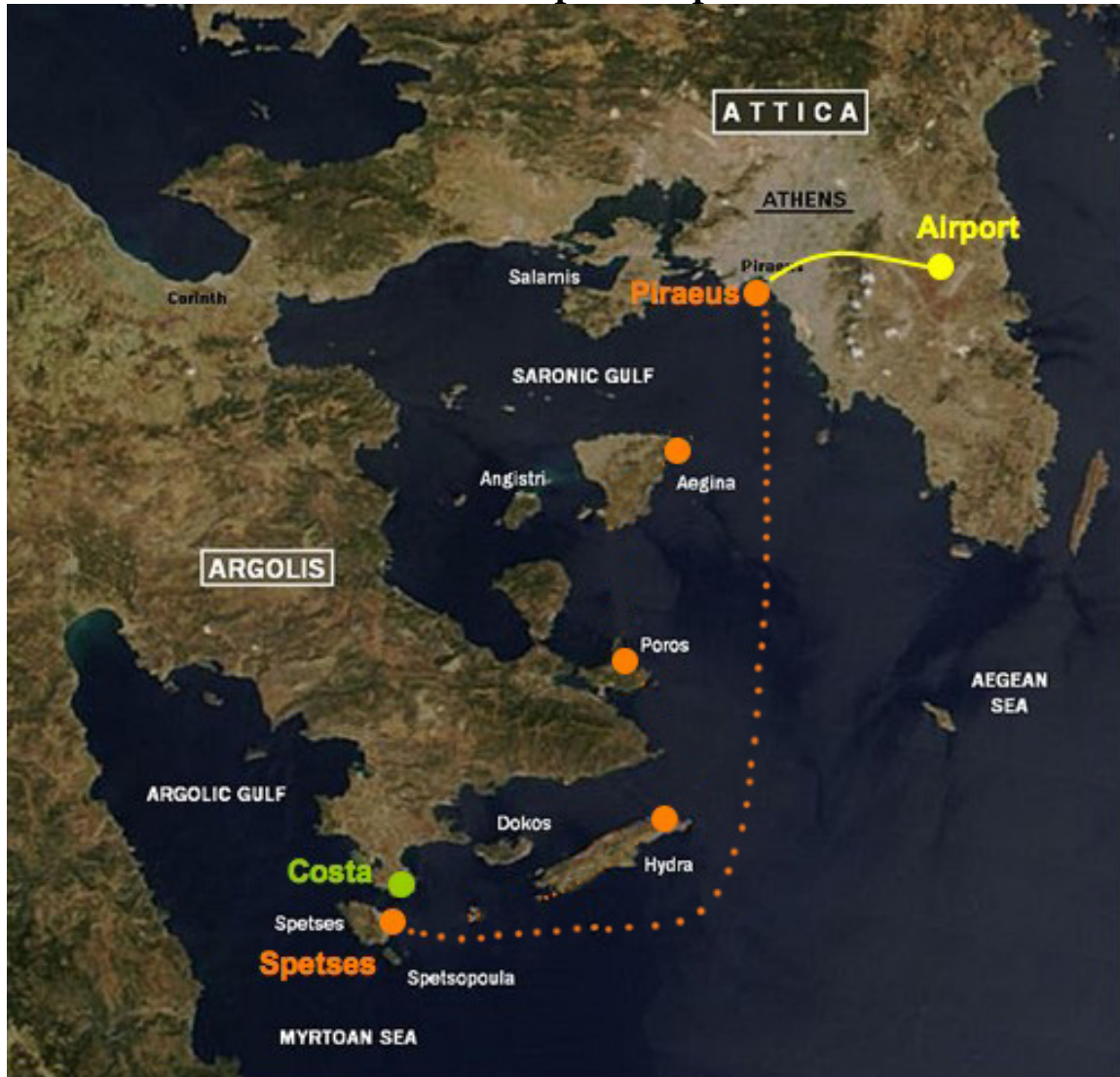
Map 1: From Airport to Piraeus and from Piraeus to Spetses